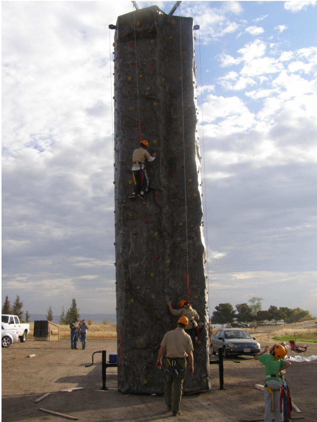
The council's brand new 32 feet tall mobile climbing wall saw a large amount of participants attempt to scale any one of its 4 different paths.