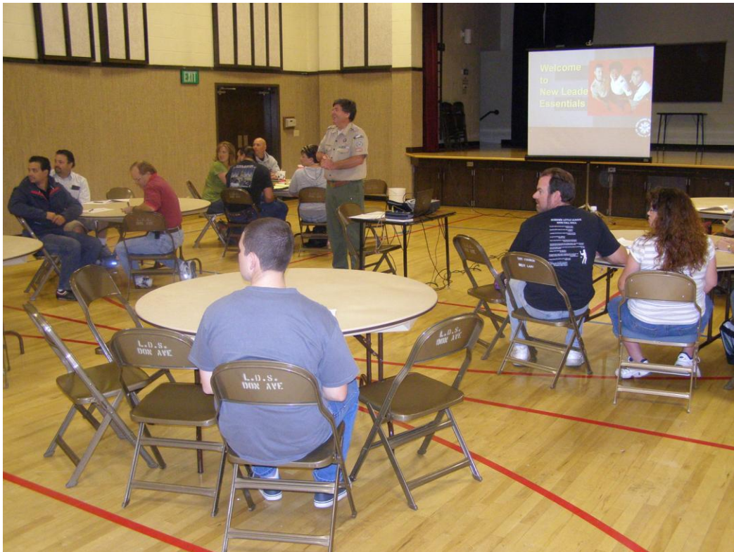
Big Valley's New Leader Essentials Training on October 25 th .