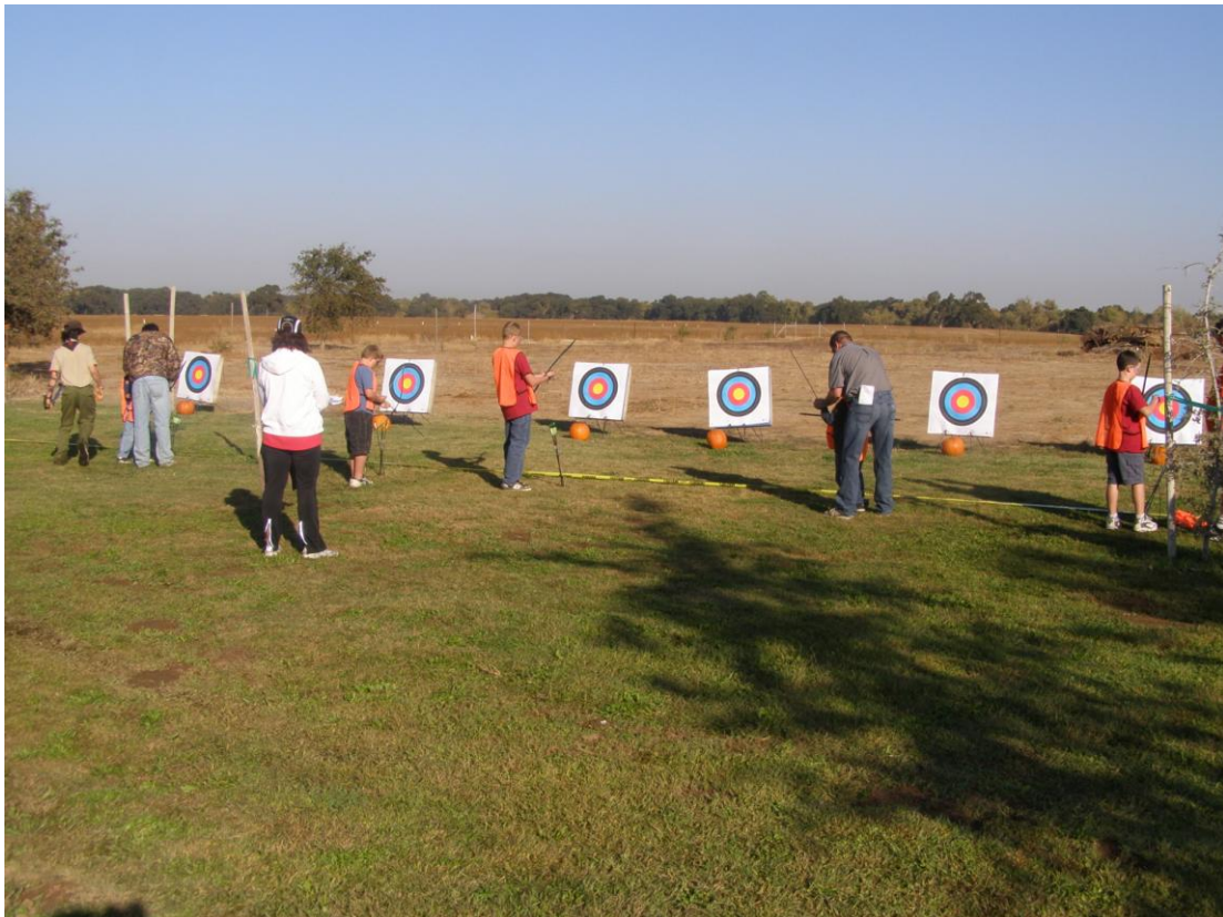
The Archery Range at the 49er Shooting Sports Day October 25 th .