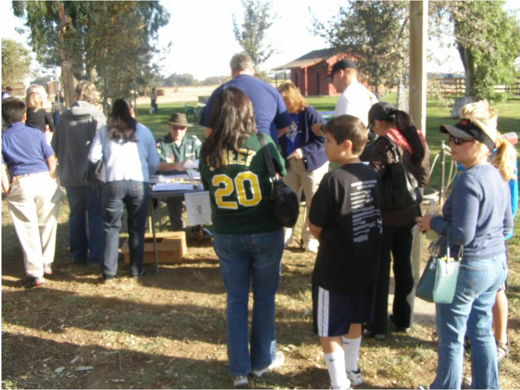
Registrants line up to sign in at the 49er Shooting Sports Day