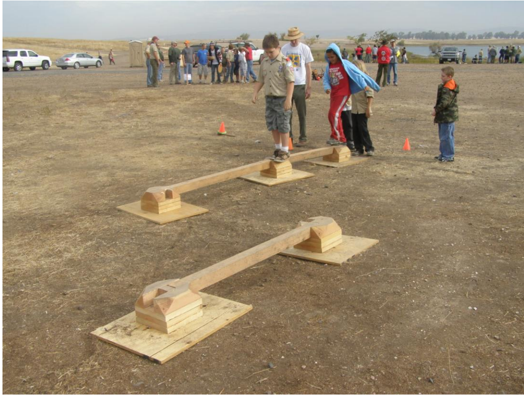
One of the many C.O.P.E. ( C hallenging O utdoor P ersonal E xperience) type games that youth could take part in at the LDS Camporee.