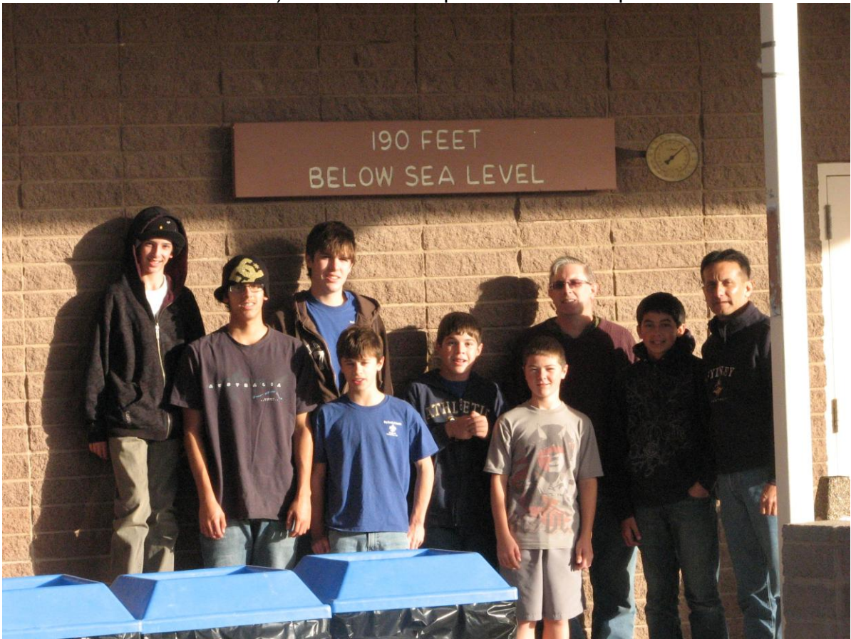
Furnace Creek Visitor's Center

On Dec 13, the Penguin patrol of Troop 81 of Patterson went to Death Valley National Park on a 4 day 3 night camping trip. A great time was had by all (eight Boy Scouts and two adults) Here are three pictures of that trip.