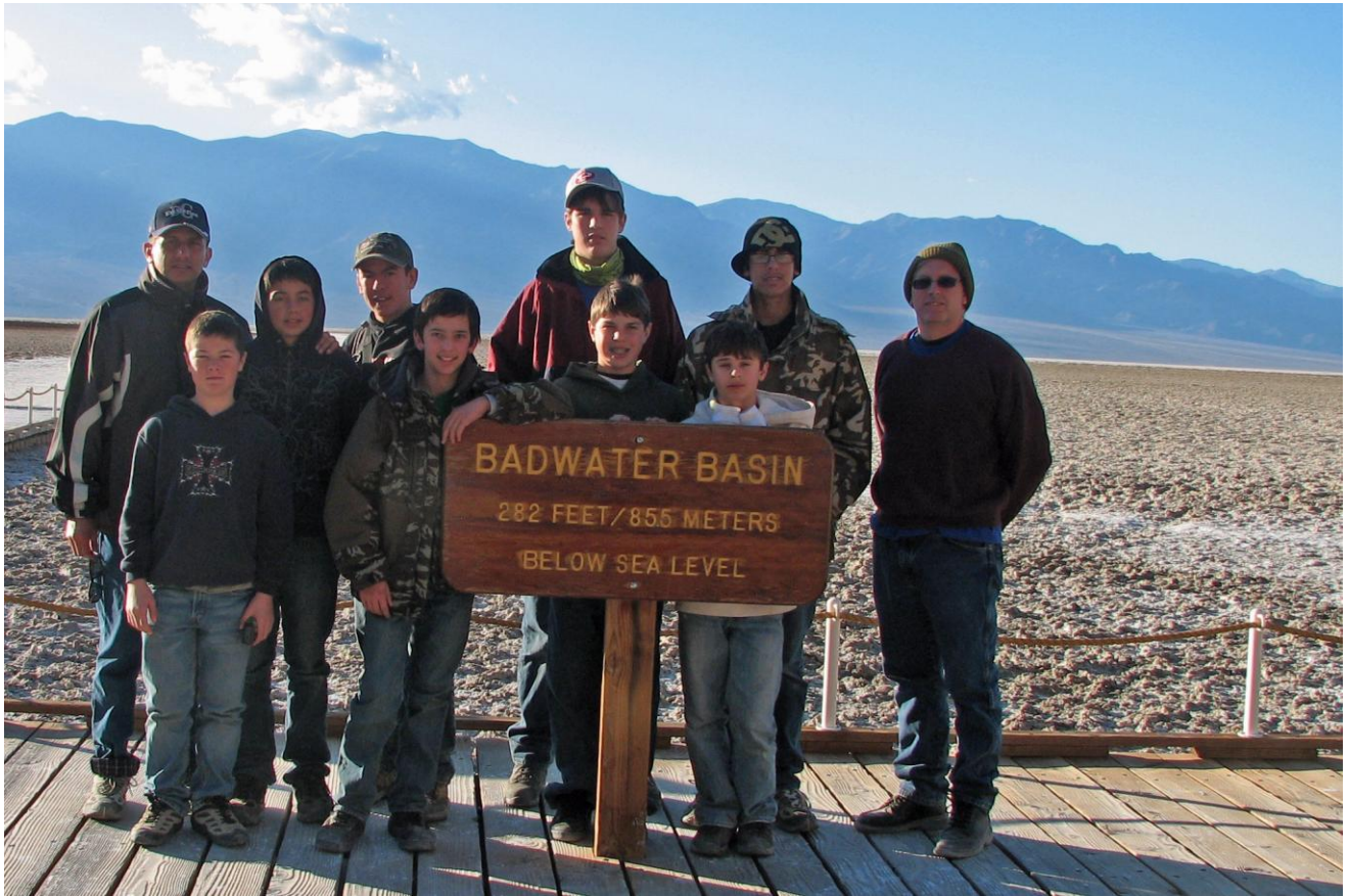
The lowest point in North America.