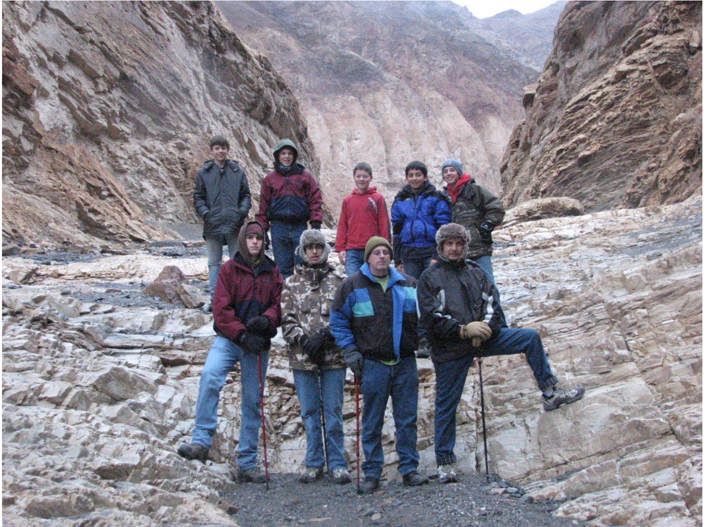
Scouts hiking through Mosaic Canyon