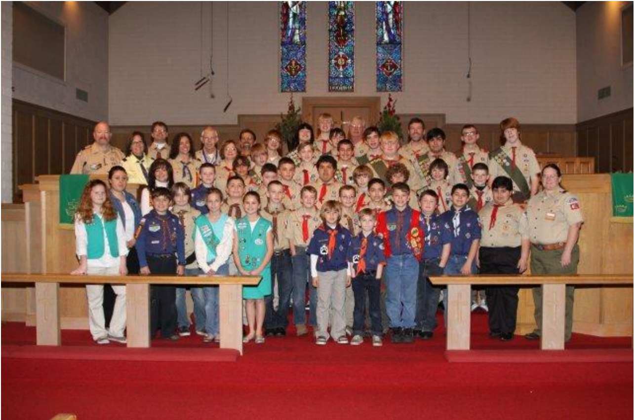
Group picture of Scout Sunday, Turlock 1st United Methodist Church. Pack and Troop 451