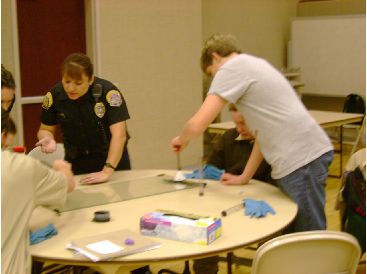
Scouts work on the Fingerprinting Merit Badge at the Waukeen Merit Badge Midway on January 31 st .