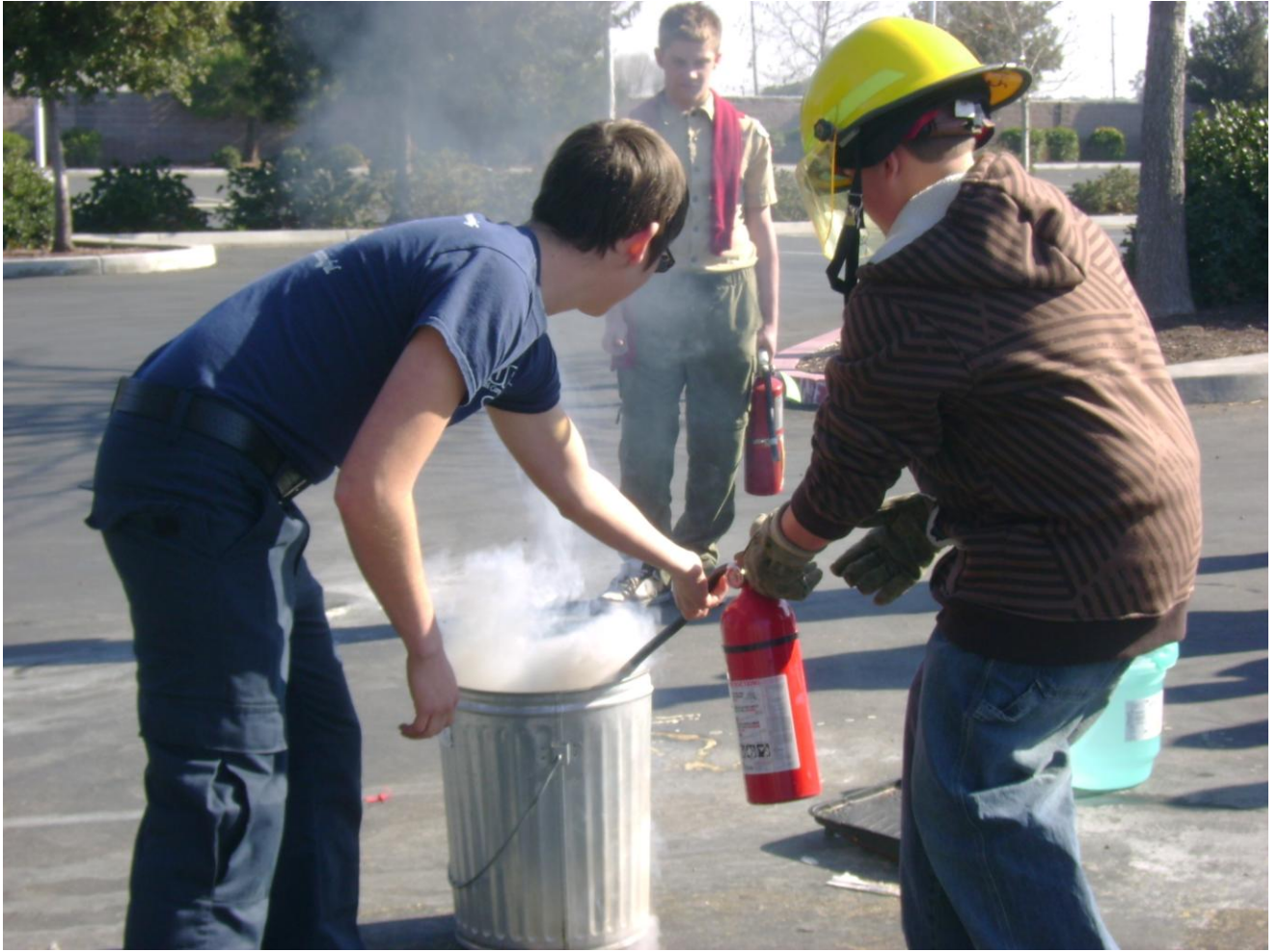
Scouts work on the Fire Safety Merit Badge at the Waukeen Merit Badge Midway on January 31 st .