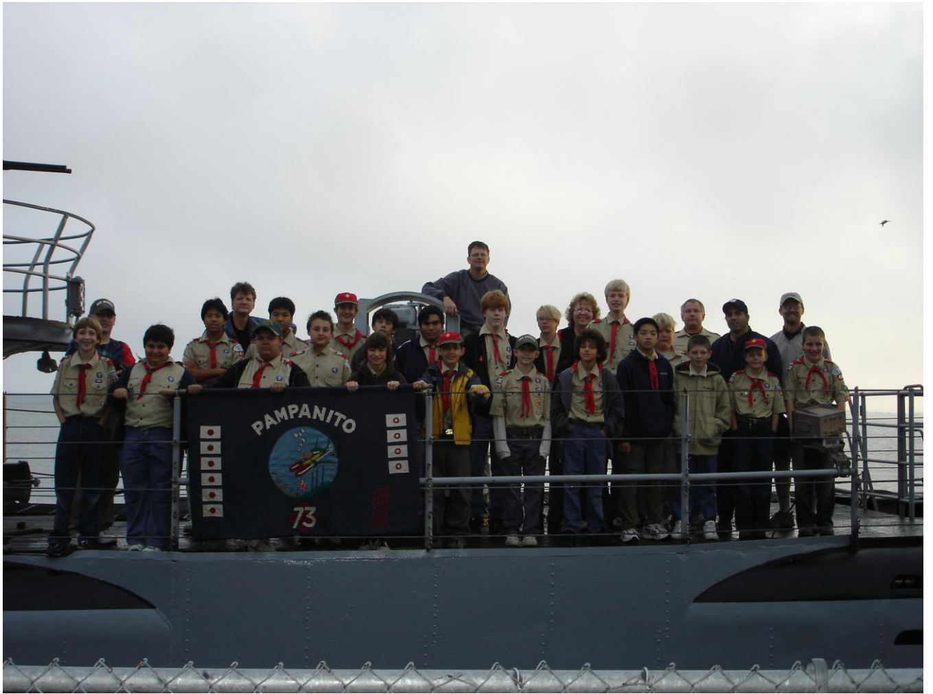
Troop 451 out of Turlock aboard the SS Pampanito.