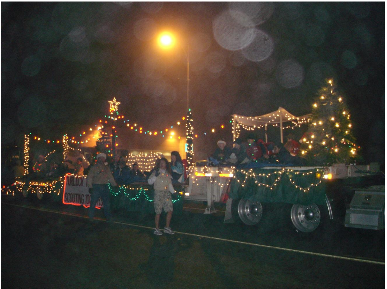
Pack 451 at the Turlock Christmas Parade.