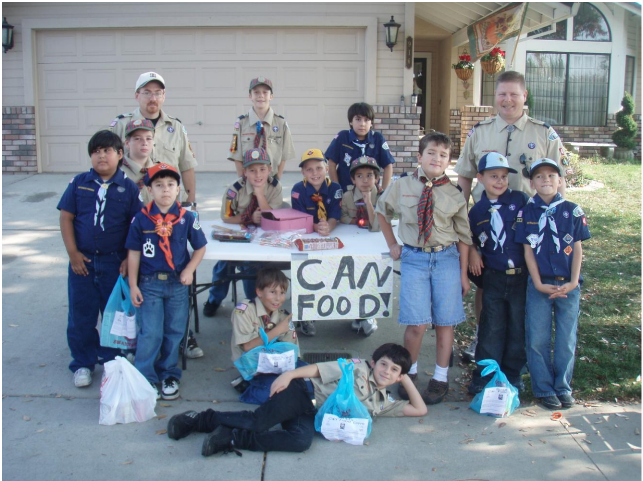
St. Stanislaus Pack 4 at their Canned Food Drive November 15 th .