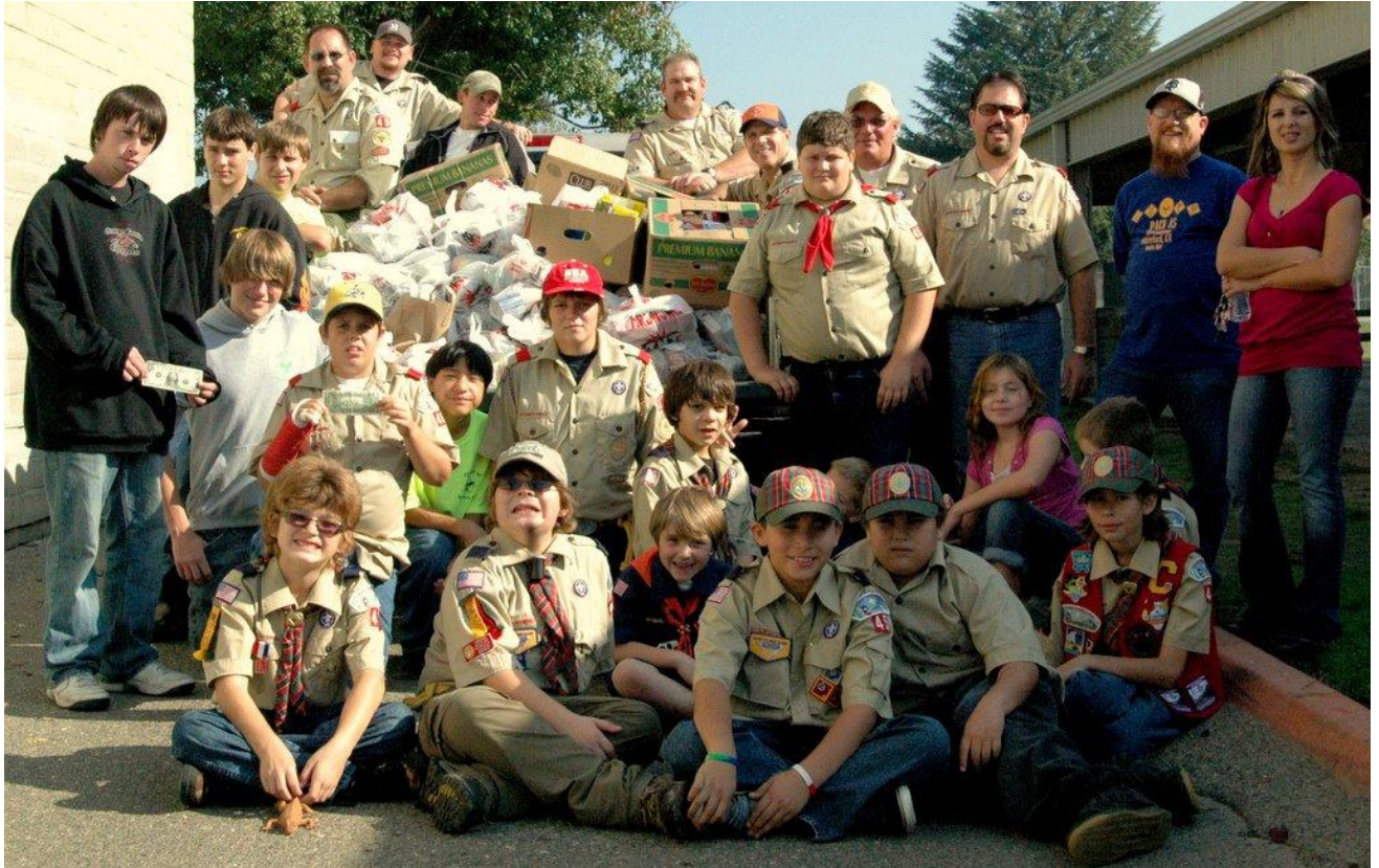
Waterford Pack and Troop 45 Scouting for Food.