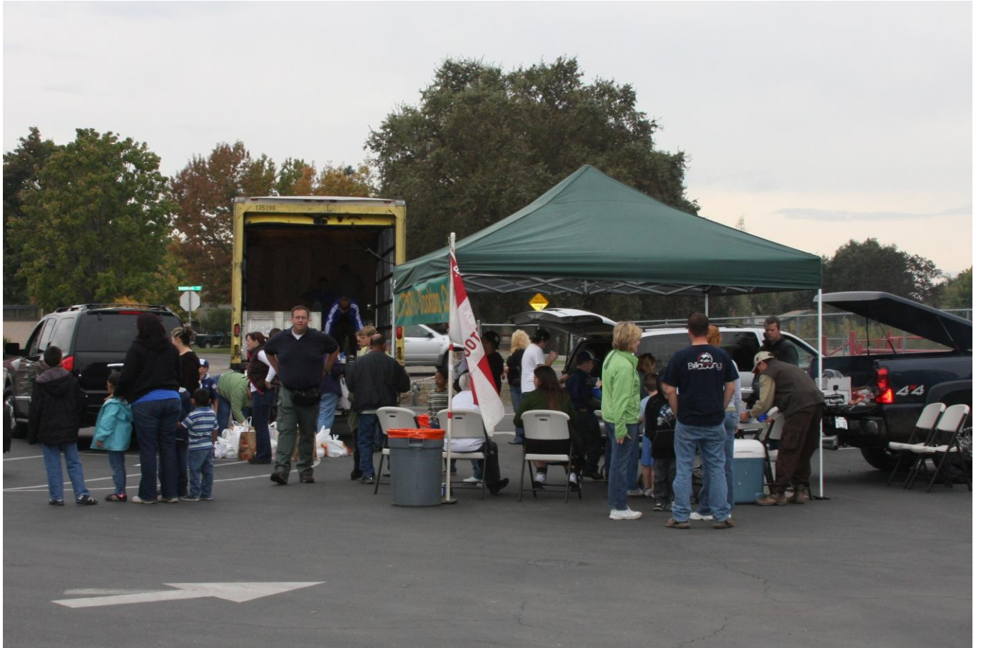
Stockton Pack 10 Scouting for Food.