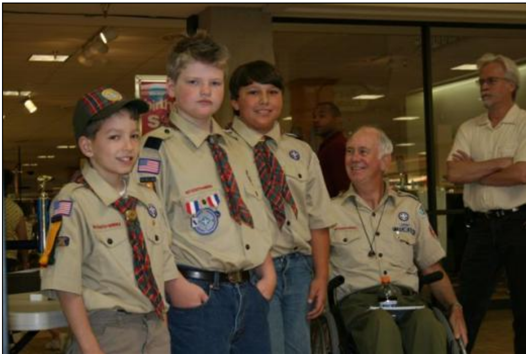
Wawona District Pinewood Derby Winners