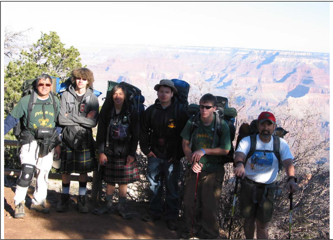
Tracy Troop 525 Backpacked the Grand Canyon over Easter break