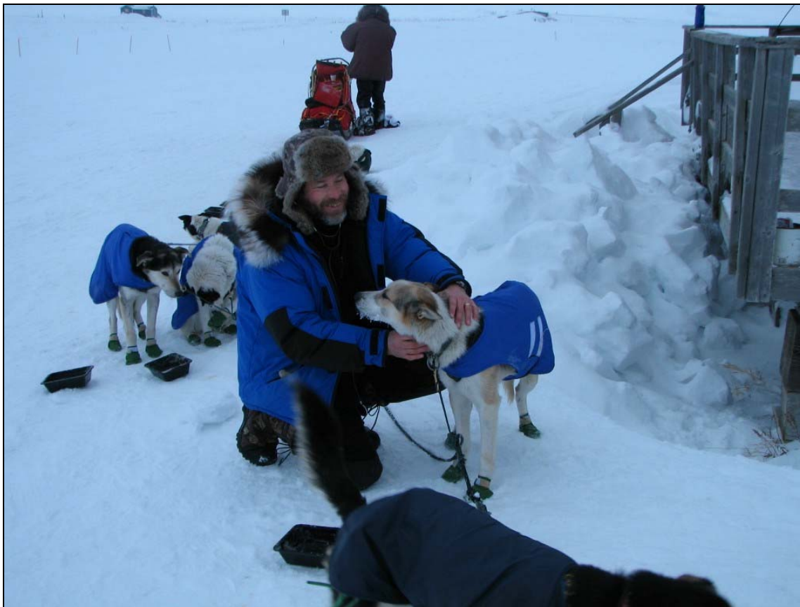
Turlock Troop 451 Scoutmaster and Veterinarian examines a team of dogs in the Iditarod. This was done at a safety check point 22 miles from the finish line in Nome, AK

Send us articles and photos (.jpg format) about your district events, unit service projects and other special activities. We'll include as many as possible in upcoming issues of eNews! Email to RSchell@bsamail.org