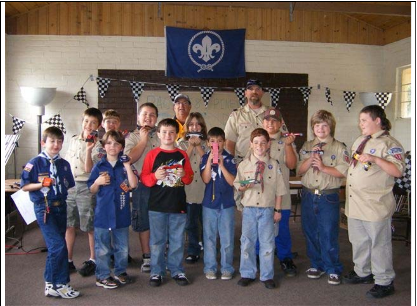
Los Banos Pack 58 Pinewood Derby race participants