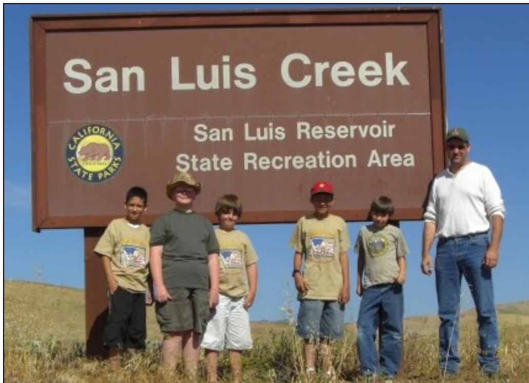
Denair Troop 28 placed boundary signs as a service project for San Luis Reservoir