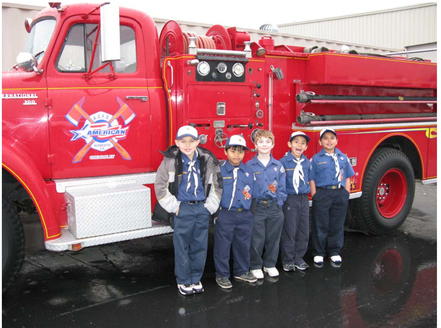
Cub Scouts from Pack 3 in Modesto visited American Chevrolet