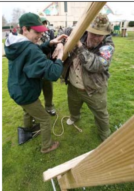
Left: "Pine-car racers speed across the finish line during the Scout-O-Rama Saturday at the Grape Festival grounds. The annual event brings cub scouts, boy scouts, sea scouts, and more together to take part in events including demonstrations by the sheriff department, leather working, pine-car racing, crossing rope bridges, and firing trebuchets."