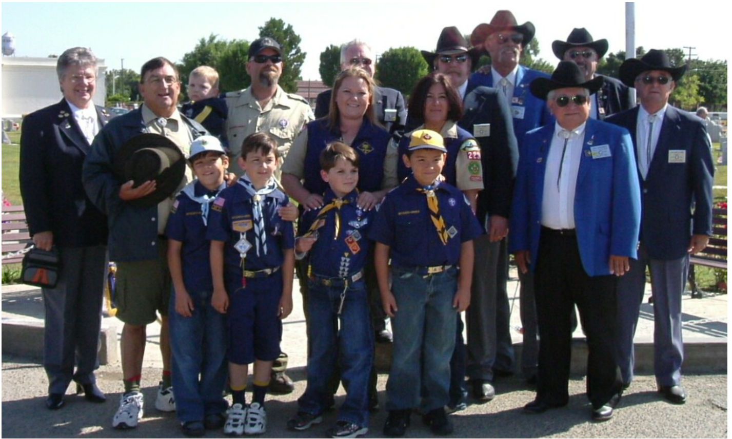
Pack 58 and their sponsor, Los Banos Elks Club, joined several service groups and community organizations and held a service and tribute to commemorate Memorial Day 2008 in Los Banos.