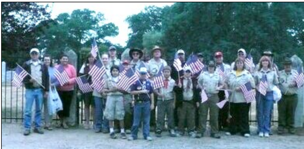
LaGrange Pack and Troop 17 collected litter, placed flags on veterans' graves and held a flag retirement ceremony at LaGrange Cemetery.