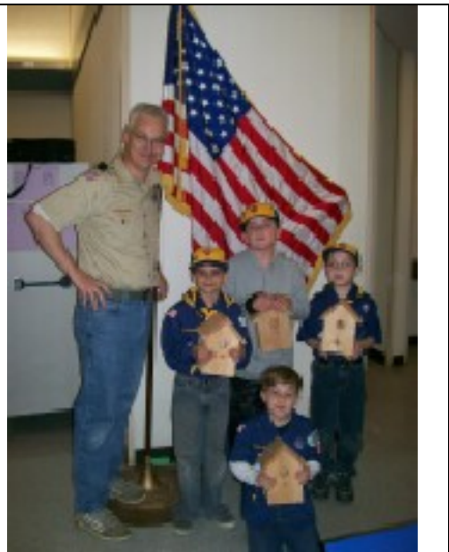
Chief Tenaya District's Pack 37 Wolfs made tool boxes and bird houses.