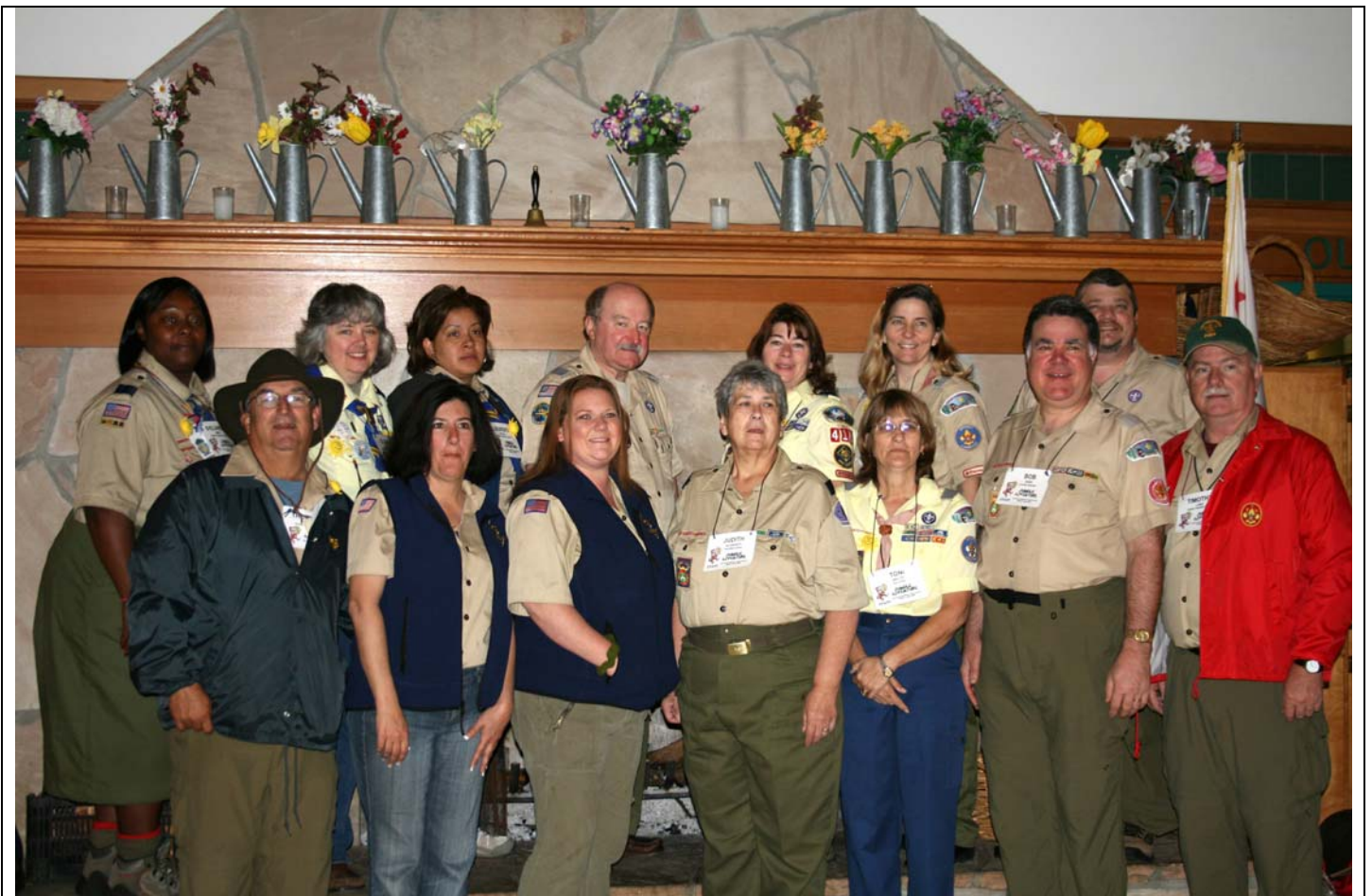
National Camp School staff and attendees from Greater Yosemite Council

Send us articles and photos (.jpg format) about your district events, unit service projects and other special activities. We'll include as many as possible in upcoming issues of eNews! Email to RSchell@bsamail.org