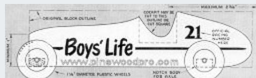
Don Murphy's Drawing of Original Pinewood Derby Car Design, 1953

Murphy decided the car kit should consist of a 7 3/8 " block of pine wood with small wooden struts that would hold the axles. The "axles" , were nothing more than finish nails. The pinewood car would resemble a Grand Prix Racer. The little block of soft pine wood could easily be carved and shaped into any design the boy could imagine. Murphy also wrote the rules that would govern the race.