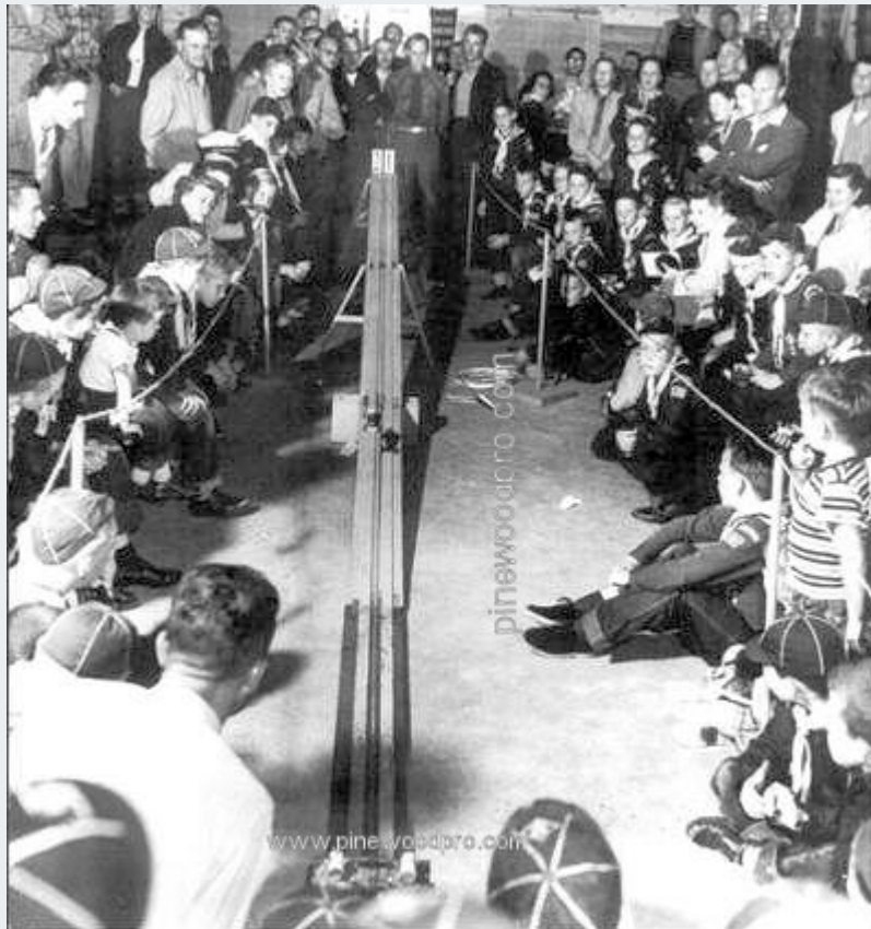
First Pinewood Derby Car Race - Manhattan Beach Scout House 1953

"classes" of racers based upon the boy's age. Class A was for 10 year olds, Class B for 9 year olds and Class C for 8 year olds.