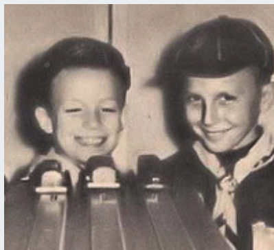
Two Cub Scouts await racing their cars, 1953