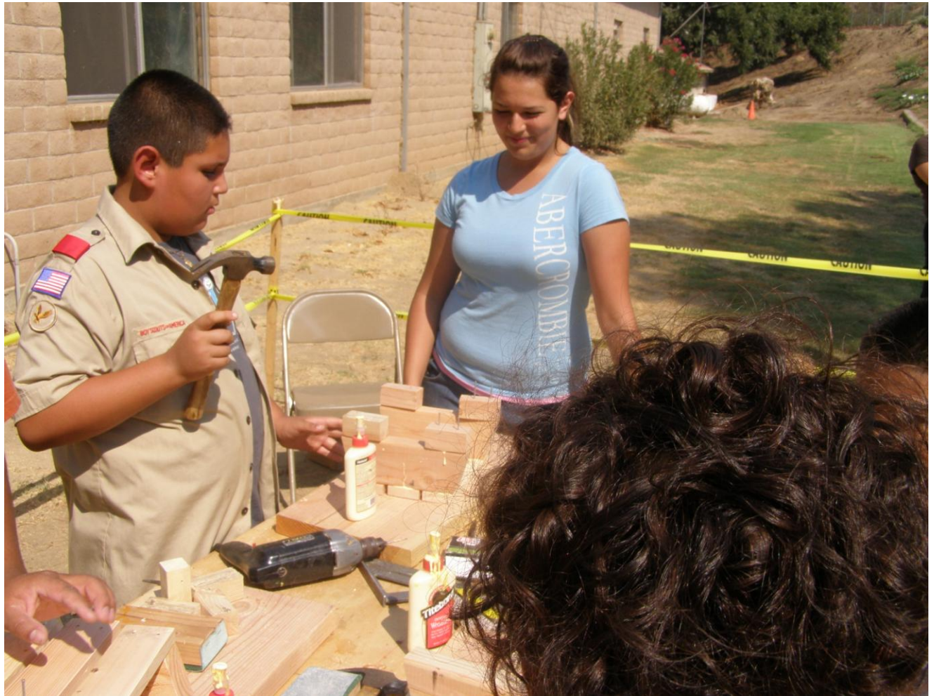
The Craftsman area from September's Soccer and Scouting Day Camp drew plenty of participants.