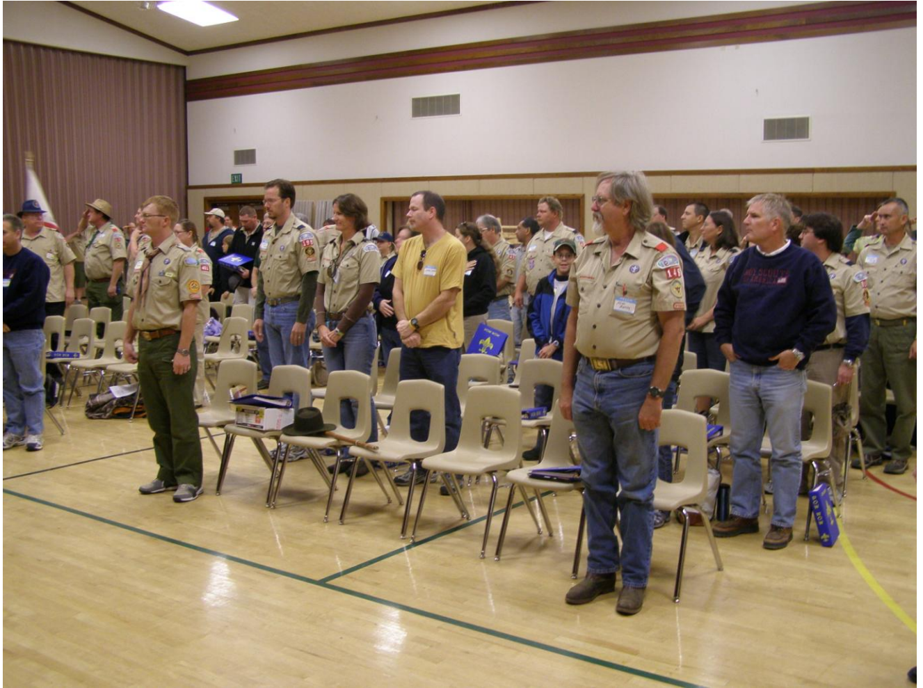
Participants at the University of Scouting and Pow-Wow stand for the presentation of the colors.