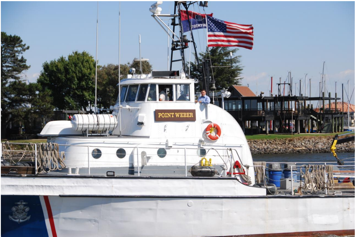
Sea Scout Ship 001 The Point Weber out for a cruise on the Delta.