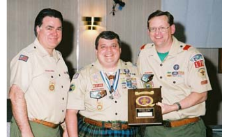
Council Key 3 displaying Quality Council Plaque